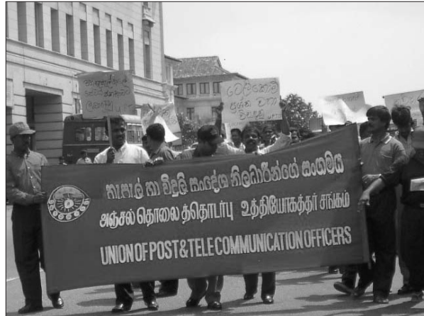
May Day 2002. Postal Workers Union members worked to rule for five days in 2001