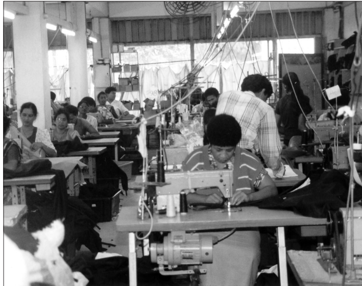
Typical garment factory.

Employees not belonging to a recognised trade union have the right to lodge a complaint directly with the Labour Department. The complaint may be filed at the office or in writing. Following receipt of a complaint, inspectors conduct an investigation and if need be de-